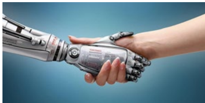
Figure 5: The Depiction of the Human-Machine Collaboration

The depiction of the harmonious integration between humans and machines is captured in Pic5, showcasing the potential of this collaborative effort.