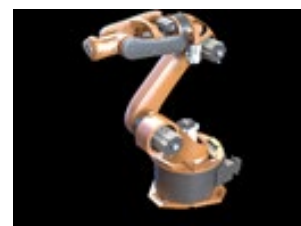
Figure 1: A Depiction or Illustration of the Robotic Arm