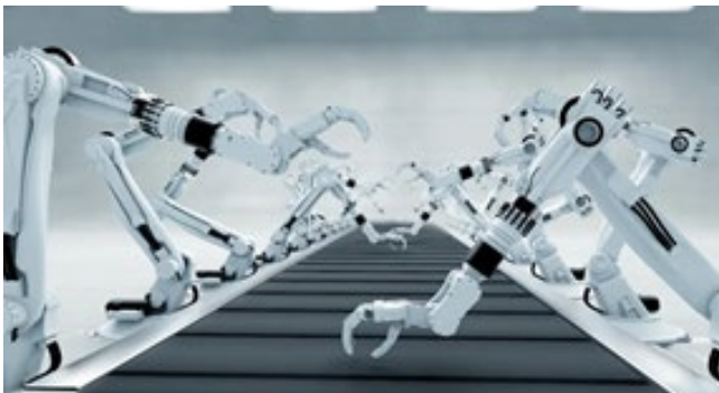
Figure 3: An Image of the Robotic Arms

The depiction of the robotic arms is displayed in Pic 3.