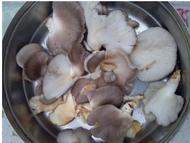
Figure 1: Pleurotus Sajor-Caju

Soups are commonly used as appetizers. Experiments were conducted to prepare good quality ready-to-make mushroom soup powder using quality mushroom powder produced from the sun dried oyster mushroom. Whole oyster mushrooms were finely ground in mixer grinder. Mushroom soup powder is prepared by mixing this powder with tomato-potato powder and other ingredients (Figure C and D).10-15 grams of powder mixed with water to make one bowl soup with characteristic aroma and taste. The oyster mushroom soup powder can also be used in curry preparation. The moisture content of the newly developed soup was lower than the reports of other studies [9].