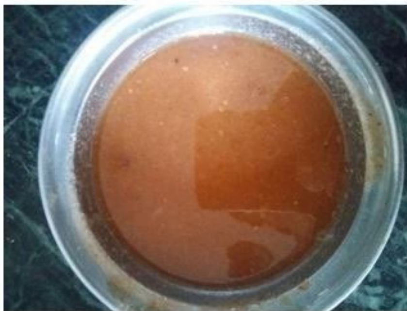
Figure 5: Tomato-Mushroom Ketchup

of water for 20 minutes. Mushroom paste is prepared using a mixer grinder. Corn flour and other ingredients are mixed in the paste and cooked to bring it viscous. Then the ketch-up is filled in the sterilized bottles or jars (Figure.E).