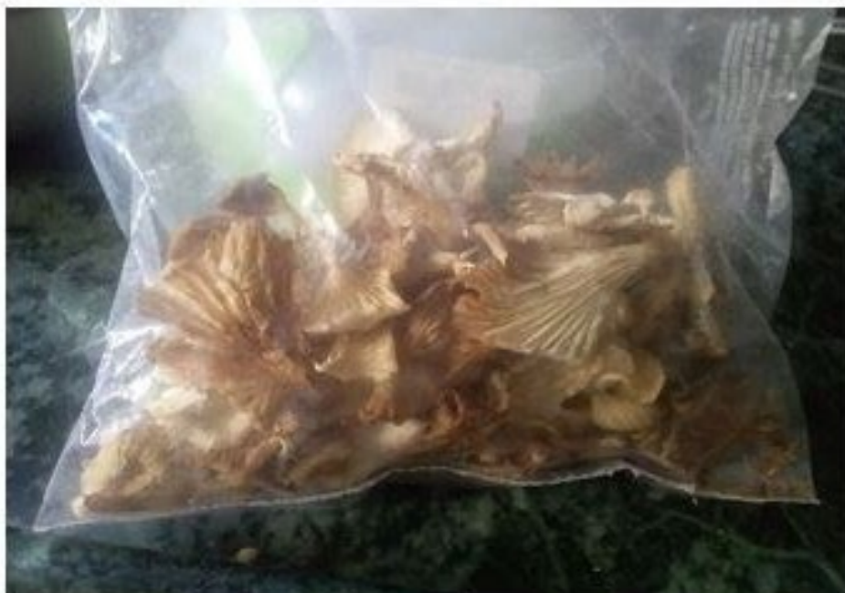
Figure 6: Dehydrated Mushroom