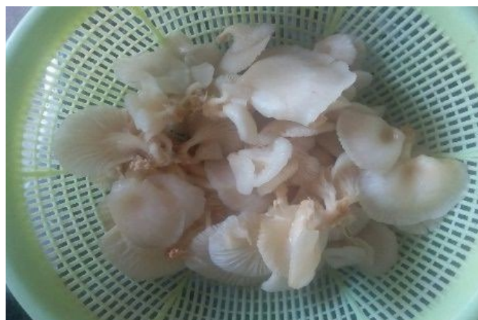
Figure 2: Pleurotus Ostreatus