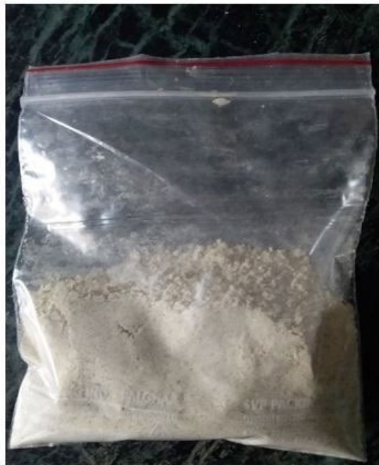
Oyster mushroom powder