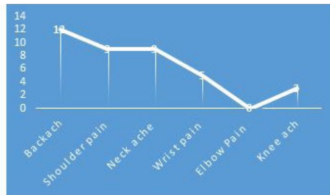
Figure 3: Shows the Prevalence of Musculoskeletal Problems

noticed any pain in their elbow joint. “See below Figure (3).” Based on the survey 62% of dentists always used chairs during treatment procedures whereas 4.9% never used them.